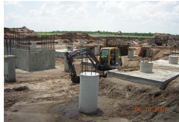
Backfilling is underway at the Burnett College June 15, 2007

Phase II Guaranteed Maximum Price (GMP) contract has been finalized with Whiting-Turner. The value of the Core and Shell package amounted to $35,440,475. Phase III Interior Fit-out GMP will be submitted on June 15, 2007 for UCF review.