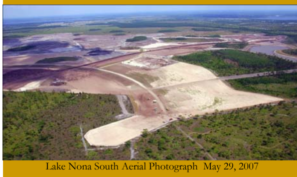
Lake Nona South Aerial Photograph May 29, 2007