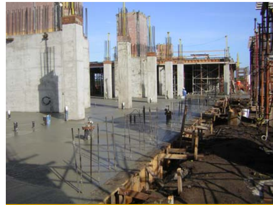
Final Slab-on-grade pour with 2nd Floor decking, September 14, 2007

The last phase of slab-on-grade was completed on September 14, 2007. The second floor elevated slab is being decked and prepared for a partial pour on September 28, 2007. At the present pace, we expect the structural frame to be completed around February of 2008.